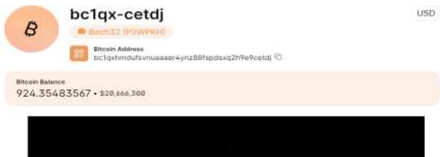
Figure 2: Example Wallet Information on Blockchain

public blockchain can show a crypto wallet address' transactions. Interestingly, other potentially sensitive information available for public viewing can also flow from a crypto wallet address if it is looked up on the blockchain. This includes the amount of cryptocurrency a wallet address contains on a certain cryptocurrency's blockchain, along with the amount of crypto that the wallet address has sent and received. For example, simply navigating blockchain.com and looking at a Bitcoin wallet address yields the information shown in the example below. 100