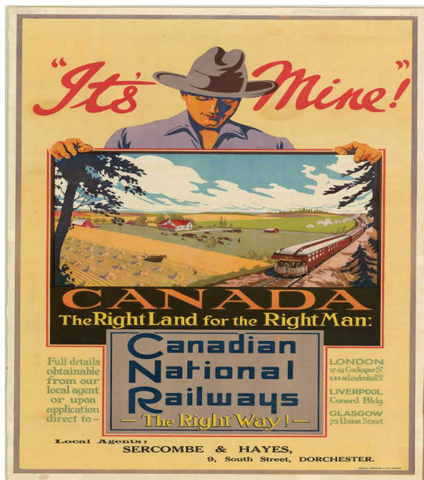
Figure 2 “It’s Mine” CANADA: The Right Land for the Rights Man: Canadian National Railways - The Right Way - ! (ID No 2905070)